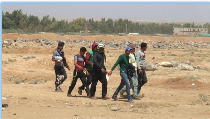
Figure 1: Young refugees re-entering Za'atari refugee camp.

Education: The research participants recognised the vital importance of education both as a marker of transition to adulthood and as a prerequisite for obtaining quality employment. However, youth reported a range of practical