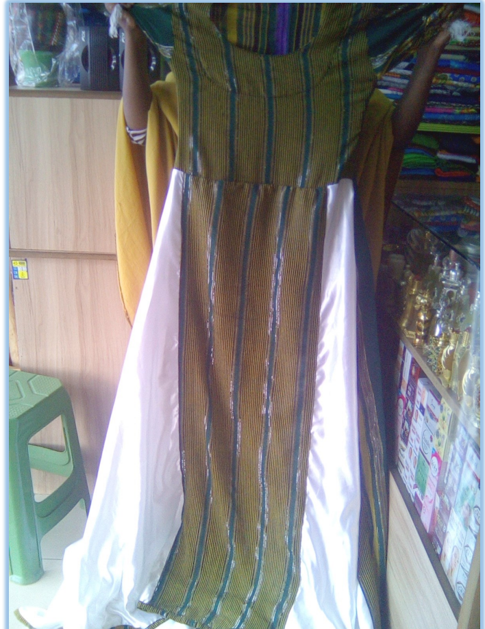
Figure 2: Research participant Khadra shows an example of a Somali wedding dress, in Kisenyi, Kampala. Photograph taken for her story map.

"It's a big step. If one doesn't have a job it is not possible to get married and establish a family" ( Zain, 20 year-old Syrian male, Za'atari ).